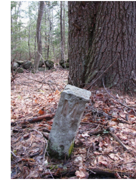
1619 B/Milford, C's sliver, twd Brookline