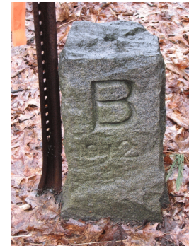
6227 B/Milford, Ruonala Rd, twd Brookline