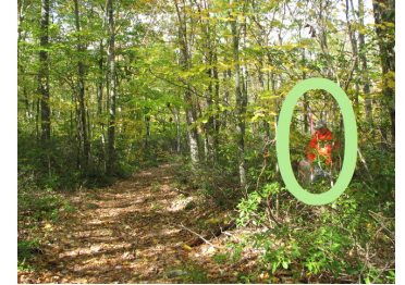
3329 B/Hollis twd Hollis Lane