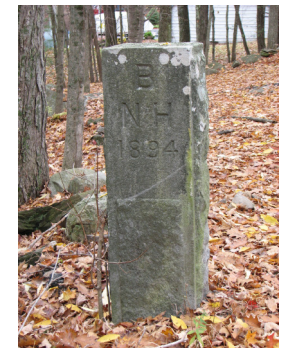
3493 B/Pepperell Oak Hill Rd