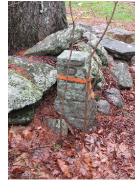
6233 B/Milford, Brkline Hutchinson Hill Rd twd Milfd Osgood Rd