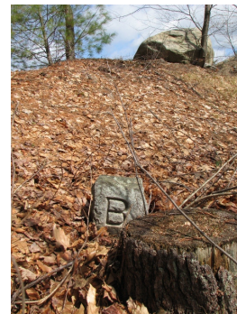
1634 B/Milford, Burbee-Spldg Brook, twd Milford