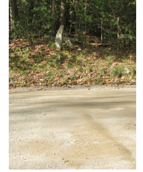
3338 B/Hollis, Rocky Pond Rd., Brookline left