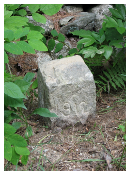
7014 B/Milford, Ball Hill Rd, M left - B right