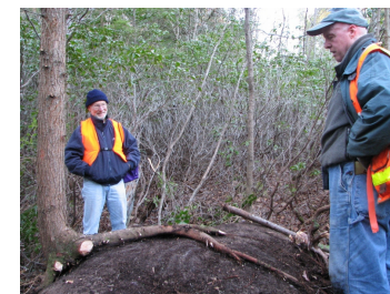
0936 Candidate boulder - no marks found

B/Milford-W of inner corner across stream N42°46’14.1” x W71°41’31.1” (Via Burbee property with Randy Haight from No Mason Road; alt is Hutchinson Hill Jeep trail) Marked B M 1912 Stickney: 1767.7' to a stone post west of a woods road