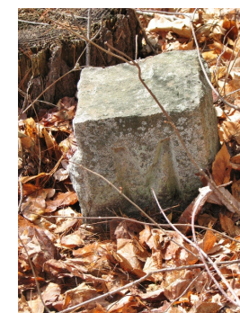
1637 B/Milford, Burbee-Spldg Brook, twd Brookline