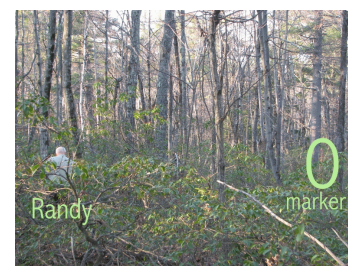
4909 Randy left, marker right, machete essential