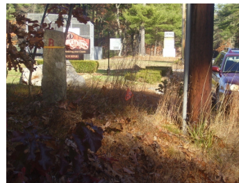
290101 B/Hollis, Proctor Hill Rd. Twd Hollis