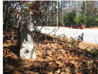
3696 B/Milford, twd Milford