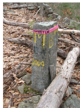
4699 Lower NW corner Milford hidden, Msn, B