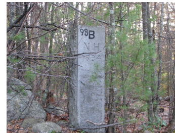
4135 B/Townsend, West Hill Rd, twd Tnsd Forest dirt road - 1894-