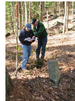
1621 B/Milford, C's sliver, twd Milford

Stickney: 2454.7' to a Stone Post in open land and field, or pasture