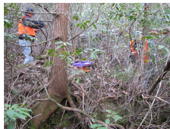
0915 Candidate boulder