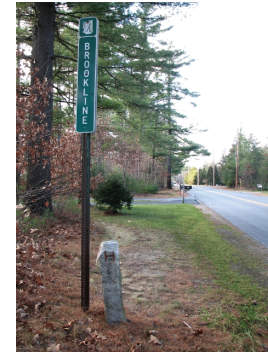
3991 B/Hollis, Pepperell Rd twd B