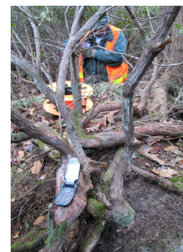
0918 Candidate boulder - glad for Randy’s machete