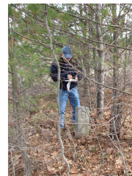
1625 B/Milford, Burbee quarry rd rt, twd Milford

Stickney: 696.6' to a Stone post on the Easterly side of the Old Spaulding road