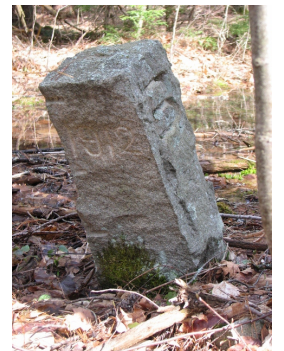
1616 B/Milford, C's sliver, twd Milford

Stickney: 1857.4' to a Stone post in edge of board yard near a roadway through it