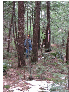
4717 Milesip inner corner, The Rock with Stones