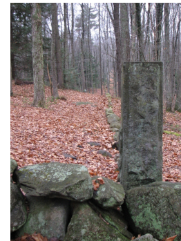
4038 B/Townsend/ Pepperell, W twd CSDA; T=left, B=rt