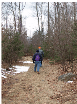
4735 Approaching B/Milford upper NW corner from Milford thru Brookline