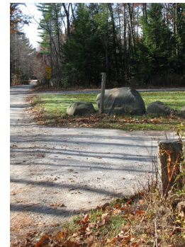
3689 B/Milford, Hood Rd twd Brookline

Stickney: 1732.1' to a Stone post on the Northerly side of the Hood road