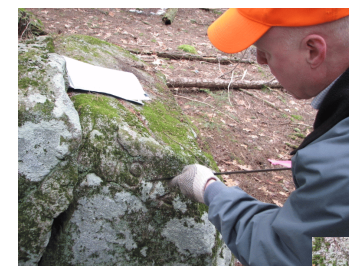
4731 Randy improving the situation