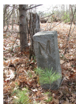
1627 B/Milford, Burbee quarry rd rt, twd Brookline