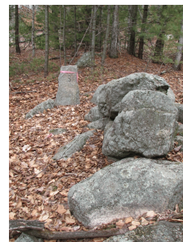
4744 B/Milford upper NW corner, B=left foreground, M=beyond marker and to right