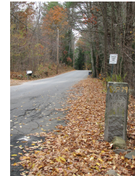
3493 B/Pepperell Oak Hill Rd twd Brookline