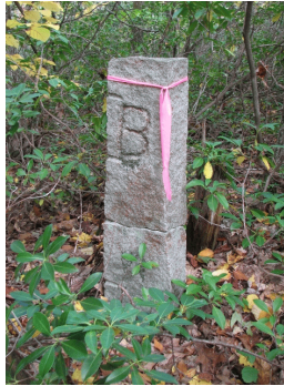
3323 B/Hollis from Hollis Lane