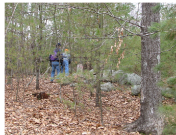
4736 B/Milford upper NW corner, foreground=B