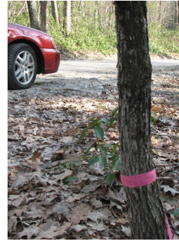
5917 B/Mason, No. Mason Rd, looking S, pipe is beyond car; stone post was near tree

(Reading at tree on N side of road, which is near where missing marker was located; pipe on S side helps define the line.)