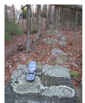
4145 B/Mason/Tnsd SW corner, twd E, Townsend right