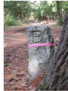
1611 B/Milford, Mileslip corner, twd Milford

Stickney: 1025.8' to a Stone post near the Oak trees