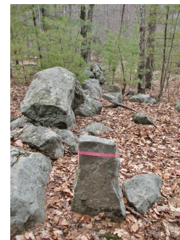
4743 B/Milford upper NW corner, M twd B, M foreground and left