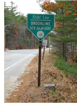
3486 B/Townsend, Rte 13, twd Brookline