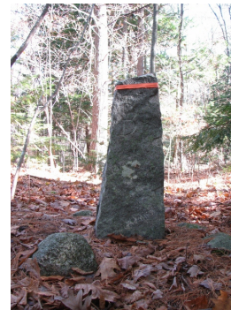
3704 B/Milford NE corner, twd Milford

South of power line land - 2 nd hill in from Route 13? About 50' into woods Stickney: 431.5' to a Rough Old Stone bound...on the land of Joel Barker... marked B M M 1912