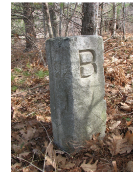
1628 B/Milford, Brubee quarry rd rt, twd Milford

Stickney: 1071.8' to a Stone post east of a woods road