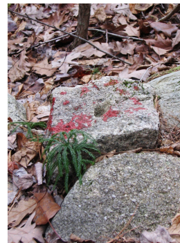
4312 B-Mason, twd Mason