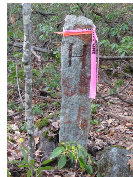
4927 B/Hollis/ Milford, No twd Milford, B=left