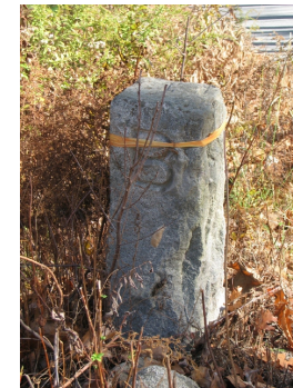
3690 B/Milford, Hood Rd twd Milford.

Stickney: 2481.2' to a Stone post on the south side of a woods road