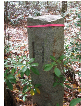
3315 B/Hollis from Hollis Lane