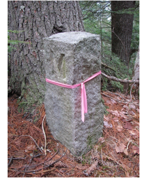
1609 B/Milford, Mileslip corner, twd Brookline