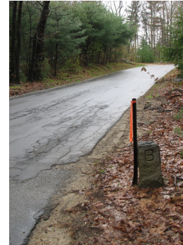
6225 B/Milford, Ruonala Rd, twd Brookline