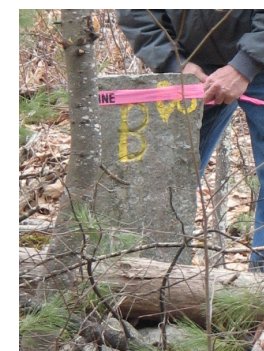
4698(crop) Lower NW corner, N twd Milford