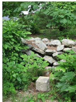
7007 B/Milford, Ball Hill Rd, M left - B right

Also: at N42°47'34.1" x W71°40'14.0" a rebar stake in ground at GPS 218 Ball Hill Rd, Milford, on apparent eastern line of Cole/Cole property. Photos of this and wall on boundary through M/B Cole parcels are available.