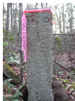
4912 B/Hollis/Milford, W twd B, 1893 DW Hayden