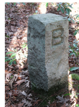
0908 B/Milfd, W of inner corner, 1912 B