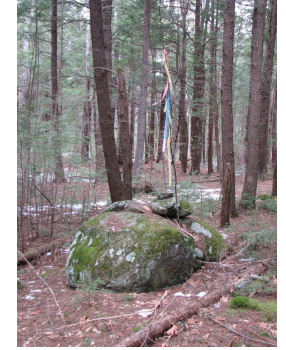
4719 Milesip inner corner, twd N - 1912 is carved behind left corner, Milford side