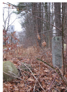
3997 B/Townsend, Townsend Hill Rd, twd Townsend