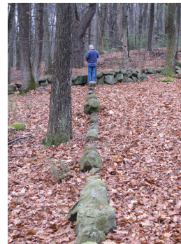
4029 B/Townsend/ Pepperell, B=left, T=near rt, P=far rt