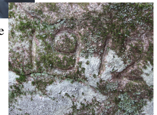
4732 1912 in 2012 on west side