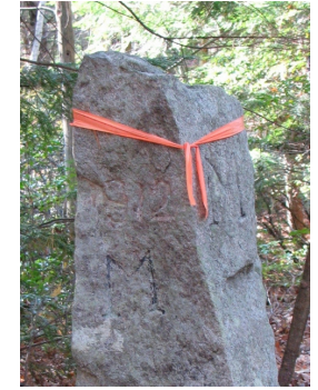
3702 B/Milford NE corner, twd Brookline