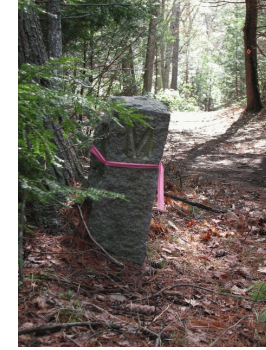
1614 B/Milford, Mileslip corner, twd Brookline