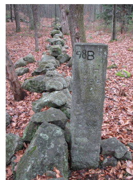
4023 B/Townsend/ Pepperell, S twd P=left, T=rt