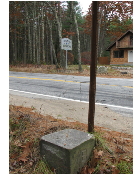
3490 B/Townsend, Rte 13, Brookline to rt