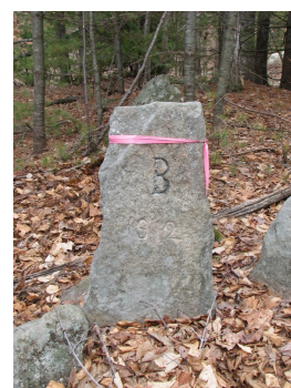
4746 B/Milford upper NW corner, B west twd Milford