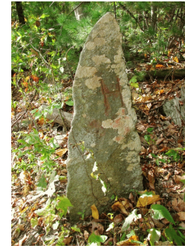
3336 B/Hollis, Rocky Pond Rd., twd Brookline