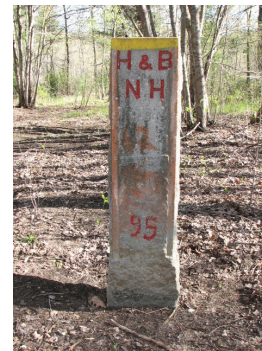
6553 B/Hollis/Pprl, twd Pepperell