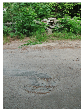
7013 B/Milford, Ball Hill Rd, twd E