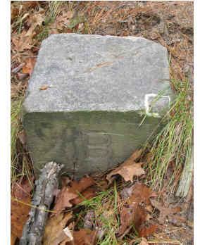
3488 B/Townsend, Rte 13

B/Townsend MA West Hill Rd Cul-de-sac N42°42'20.6" x W71°41'57.2"