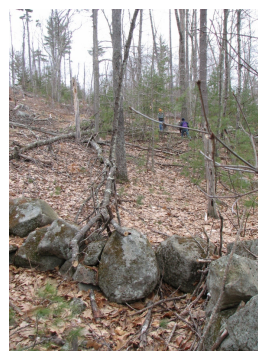
4696 Randy_Loring at lower NW marker, twd Milford

Stickney: Old Stone Bound...marked B M M 1912