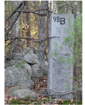
4137 B/Townsend, West Hill Road

B/Townsend/Mason-Southwest Corner N42°42'21.9" x W71°42'4.5"