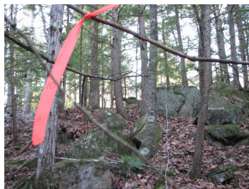
0912 Moving westerly from marker below, 200 ft at a time