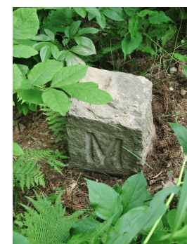
7004 B/Milford, Ball Hill Rd, S twd B