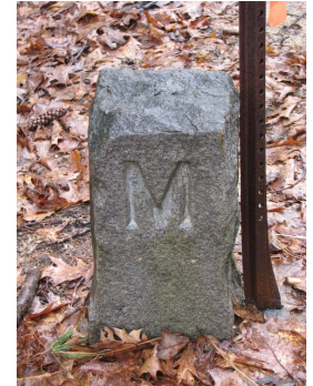
6228 B/Milford, Ruonala Rd, twd Milford