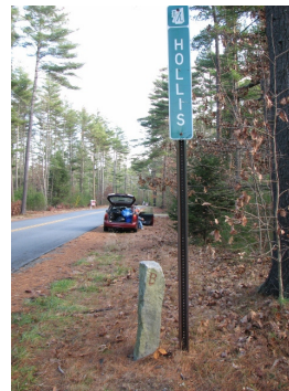
3988 B/Hollis, Pepperell Rd twd Hollis