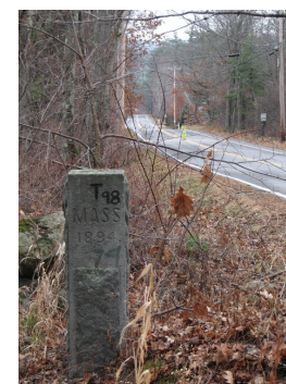
3999 B/Townsend, Townsend Hill Rd, twd Brookline