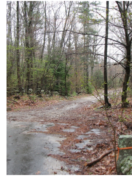
6236 B/Milford Osgood Rd twd Brookline Hutchinson Hill Rd

Stickney: 792.4' to a Stone post on the Westerly side of the Paridee road