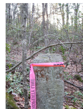
4924 B/Hollis/Milford - left foot in H, rt in M