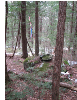
4718 Milesip inner corner, NW twd Milford from Brookline