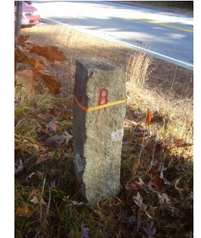
290100 B/Hollis, Proctor Hill Rd., twd Hollis