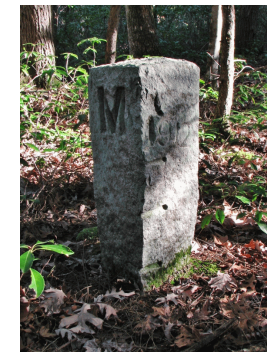
0905 B/Milfd, W of inner corner, M 1912