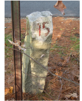
3995 B/Hollis, Pepperell Rd

B/Hollis/Pepperell-Southeast Corner N42°42'16.1" x W71°37'50.3" Access from Bemis Road, Pepperell, or Oak Hill Road, Brookline; SE of culvert installed off Oak Hill in 2011