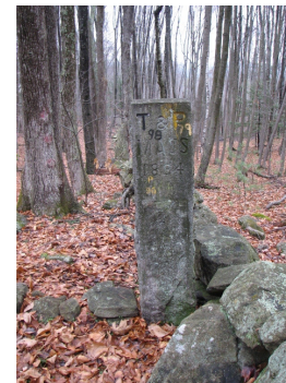
4024 B/Townsend/ Pepperell, N twd Brookline