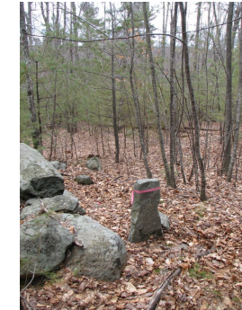
4747 B/Milford upper NW corner, feet in Milford, SE twd B