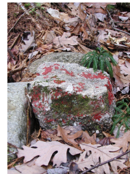
4314 B-Mason, twd B