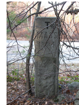
4136 B/Townsend, West Hill Rd, twd Brookline cul-de-sac