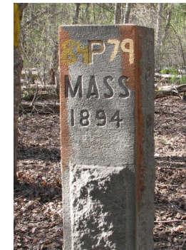
6551 B/Hollis/Pprl, twd Brookline

B/Pepperell-Oak Hill Rd N42°42'17.5" x W71°38'37"