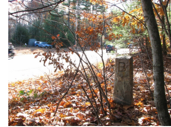
3695 B/Milford, twd Brookline