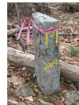
4702 Lower NW corner Milfd/Mason/B twd B