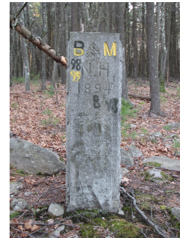
4140 B/Mason/Tnsd SW corner, S twd Townsend -1894-

Notify owner of adjacent West Hill Road property