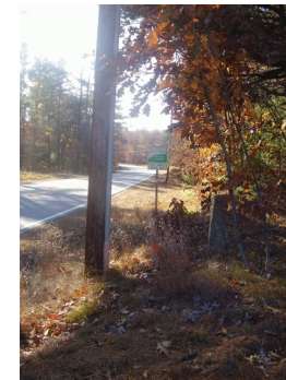
290099 B/Hollis, Proctor Hill Rd., twd Brklne