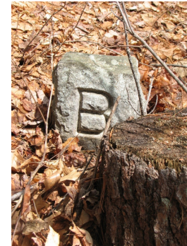
1635 B/Milford, Burbee-Spldg Brook, twd Milford