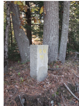
3455 B/Mason, Mason Rd.