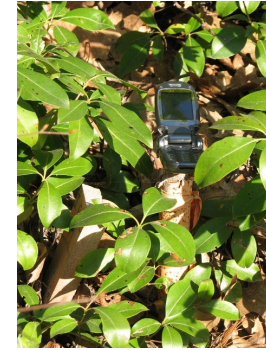
5912 B/Mason, No. Mason Rd, pipe on line

Return to Stickney description at beginning of document