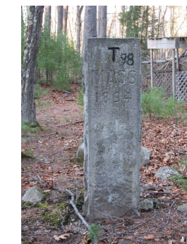
4141 B/Mason/Tnsd SW corner, N twd M/B