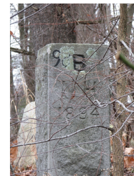
3998 B/Townsend, Townsend Hill Rd