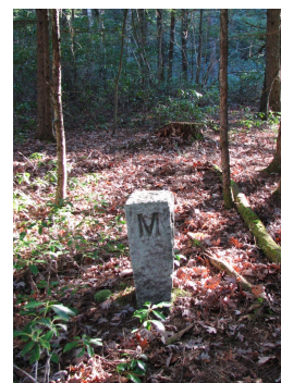
0906 B/Milfd, W of inner corner twd B