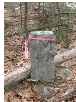
4700 Lower NW corner Milford twd B