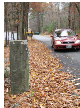
3493 B/Pepperell Oak Hill Rd twd Pepperell