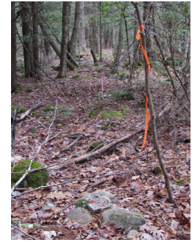
4310 B-Mason, twd S