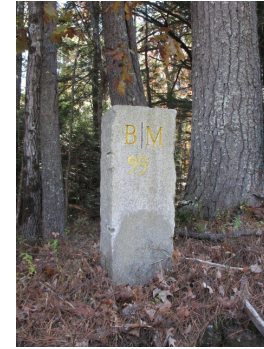
3454 B/Mason, Mason Rd.