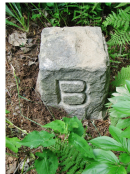
7002 B/Milford, Ball Hill Rd, N twd Milfd