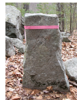
4740 B/Milford upper NW corner, M=foreground and to left, looking E twd B