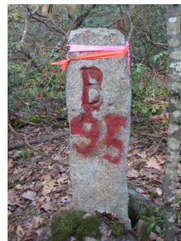
4926 B/Hollis/ Milford, E twd M=left, H=right

A machete is very helpful with the mountain laurel.