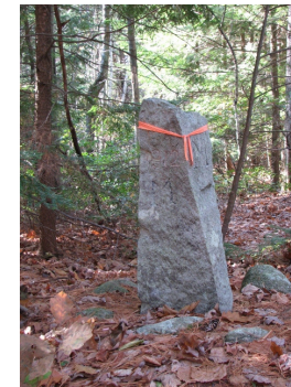
3702 B/Milford NE corner, twd Brookline