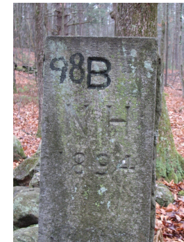
4027 B/Townsend/ Pepperell -1894-