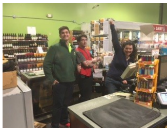
Our employees are the absolute best!

Apply in person or send email to: Apply@Route13stateline.com