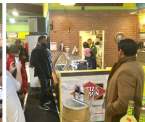
Big Papi ordering a Steak & Cheese Sub... Mmm!