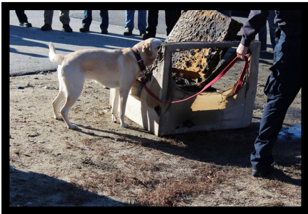
Sniffing my way through the day is my job!