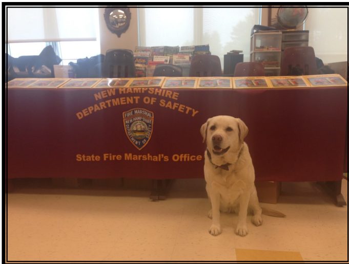
Working public outreach event. I love educating kids.