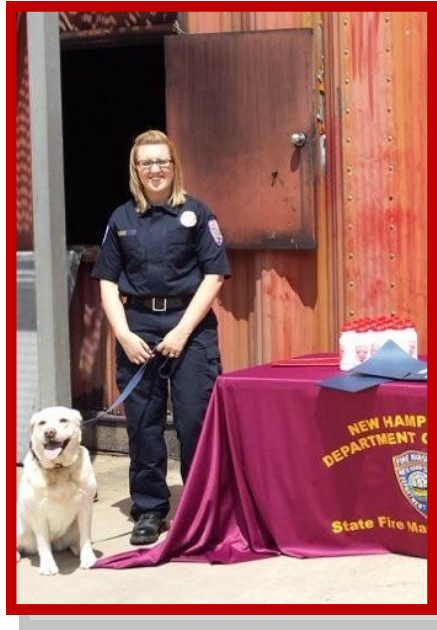
My handler and me!