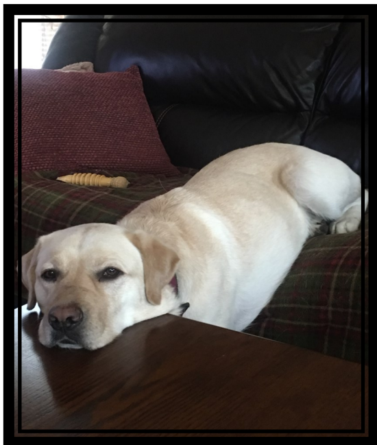
Off duty, relaxing at home.