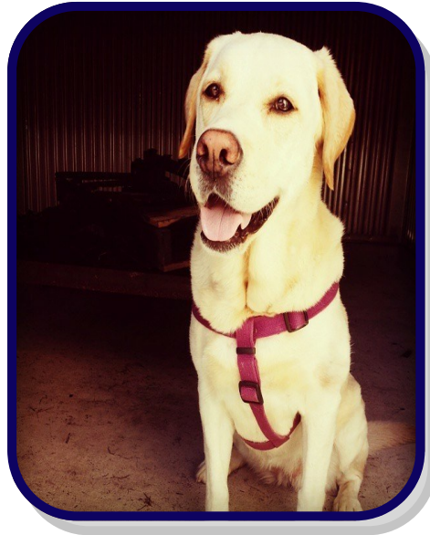
Posing for the media. I like talking about my job.