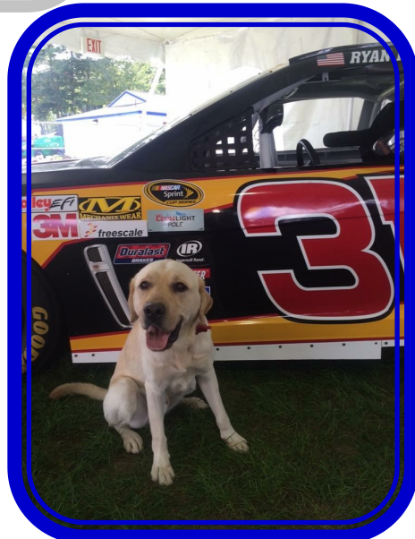
Public Outreach Events are fun!