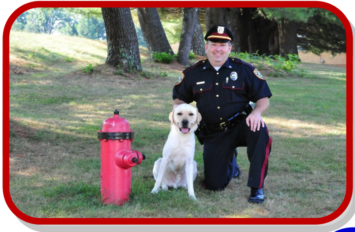
My handler and me!