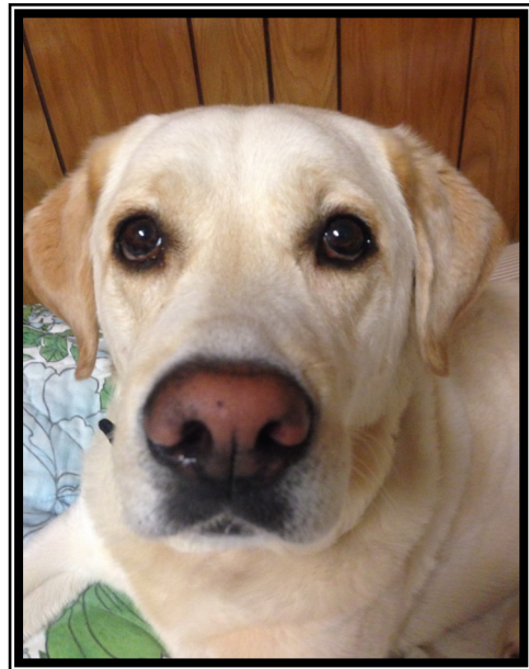
Off duty, relaxing at home.